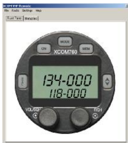
The XCOM Front panel screen, controlling all the operations of the XCOM VHF radio remotely.

When the XCOM VHF remote controller program is open either of the following two screens are displayed. Provided the XCOM VHF radio is connected directly to the serial cable and computer and the XCOM radio is turned on the active and standby frequency on the radio will be displayed on your computer screen. If you make any changes to the radio they will be reflected on the screen as the information is updated almost immediately. The only function which you do not have control over between the computer and the radio is the on and off button.